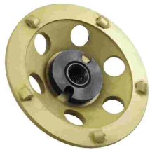
* Quarter Round PCD