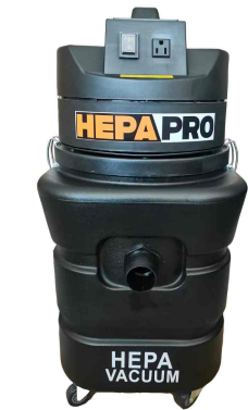
Shown above: 1-Motor, 13-Gal Tank w/ Power Tool Outlet.