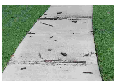
Slices Through Hard or Soft Joint Without Melting