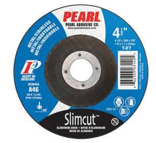
SYNTHETIC RESINOID TECHNOLOGY