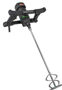
EHR 18 S

EHR 18 S – Compact mixer for 2-bag batches . . . . . Call for Price