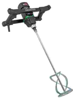
EHR 20.1 R