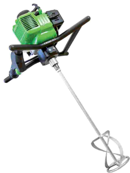
EHR 750 B

Best-in-Class for On-Site Blending Results w/ Minimum Worker Effort