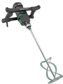
EHR 23 / 2.5 R