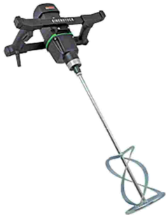
EHR 23 / 1.4 R