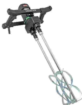
EHR 24 R / RL