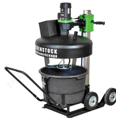
Model: TWIN MIX 1800TSD Call for Price