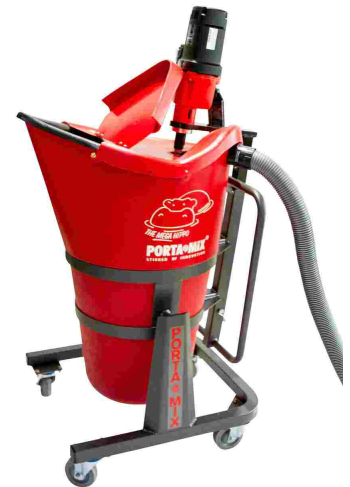
Model: PMH80F-DC3 Call for Price