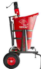
PMH80X-DC3 Call for Price