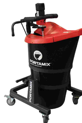
Model: PMP80DC-23 Call for Price